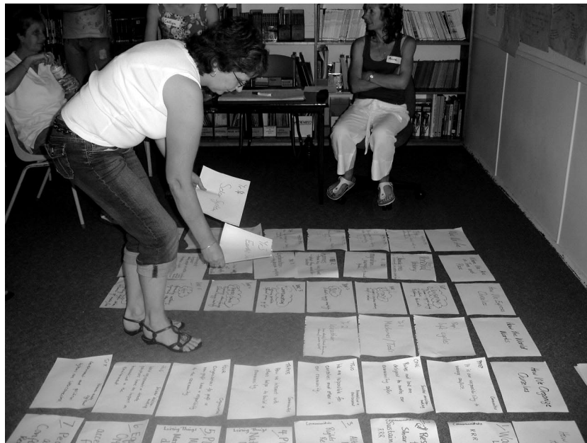
Teachers negotiate placement of units in programme of inquiry

refining a complete programme of inquiry. The proposed units of inquiry at each year level need to be articulated from one year to another. This will ensure a robust programme of inquiry that provides students with experiences that are coherent and connected throughout their time in school (examples 11 and 12).